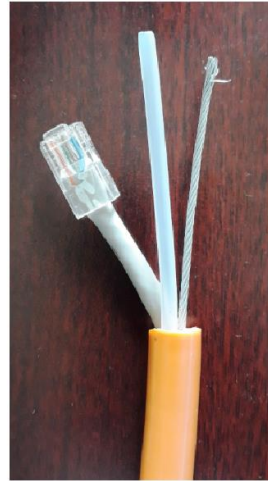
Vented Data Cable